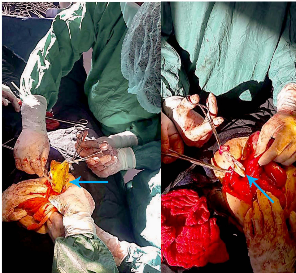
Figure 2 Intraoperative photograph(Blue arrow) showing the surgical sponge lodged within the loop of the ileum.

of a radiopaque marker on the surgical sponge allowed for diagnosis through plain radiography. Surgical exploration remains the preferred treatment for gossypiboma. However, in certain cases, surgical intervention may not be necessary as spontaneous migration can occur, leading to the expulsion of the foreign material through the anus during defecation. Percutaneous approaches are applicable for the removal of readily accessible foreign bodies but are not suitable for intra-abdominal foreign bodies. Laparoscopic methods have also been employed to remove gossypiboma. 6 To prevent the retention of foreign bodies inside patients, three essential measures should be implemented. First, meticulous counting of all surgical materials should be performed. Second, thorough exploration of the surgical site at the conclusion of procedures is crucial. Lastly, the routine use of surgical textile materials that have a radiopaque marker can enhance visibility and aid in the detection of retained surgical sponges. 7